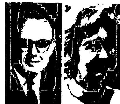
Philip Hart Lenore Romney