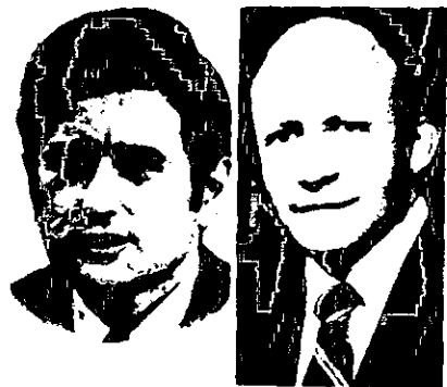
Sander M. Levin Edward H. McNamara