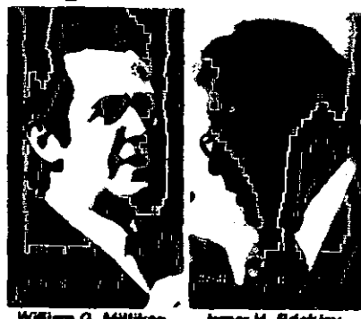
William G. Milliken James H. Brickley